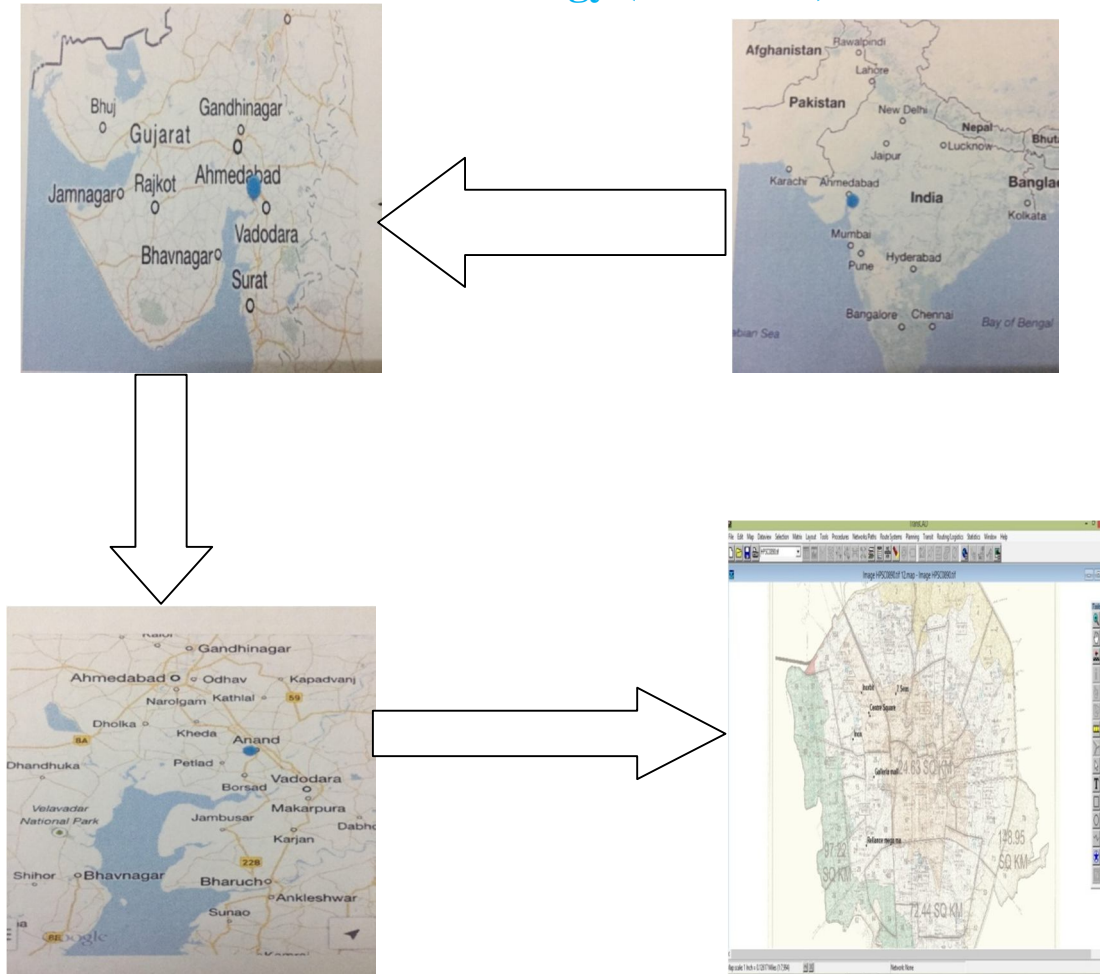
Figure-2 Layout Map

The details of selected shopping malls are shown in the following table1