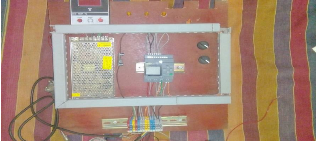
Figure 1: A Complete hardware

Our main aim is to design automated greenhouse monitoring and controlling system using PLC. There we are using various sensors which are kept inside the greenhouse which senses and variations parameters which are being monitored inside the greenhouse, PLC continuously compares with that of the standard condition required for greenhouse.