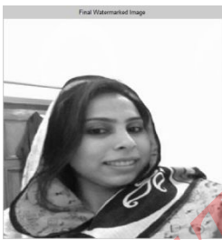
WM image (bit 1)