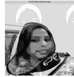
WM image (bit 6)