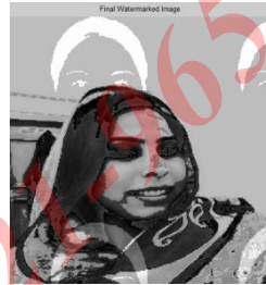
WM image (bit 7)