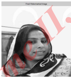
WM image (bit 4)