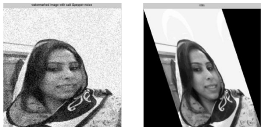
Salt & Pepper Noise