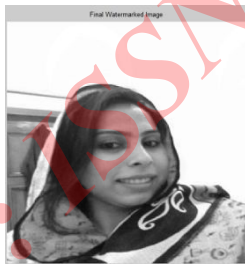
WM image (bit 2)