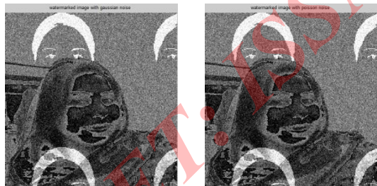
Gaussian Noise Poisson Noise