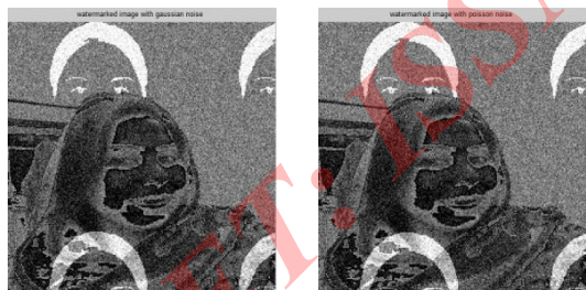
Gaussian Noise Poisson Noise