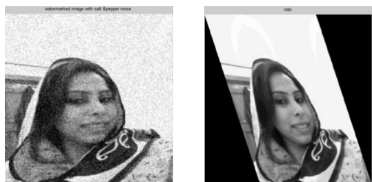
Salt & Pepper Noise