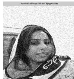
Salt & Pepper Noise