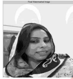
WM image (bit 5)