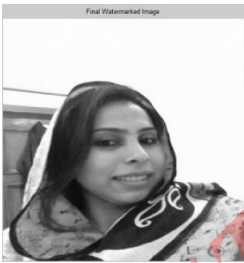
WM image (bit 1)