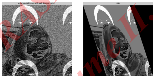
Salt & Pepper Noise Rotation

Evaluation of Various Attacks on Watermarked Image