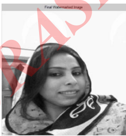
WM image (bit 3)