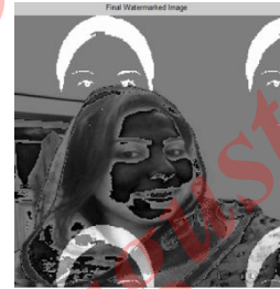
WM image (bit 8)