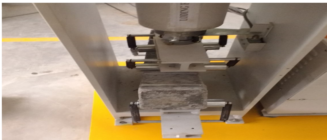
Testing Of Beam By Four Point Loading Under Flexural Testing Machine