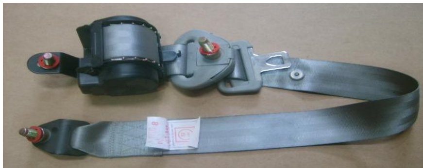
Fig. 3 Seat & belt lock