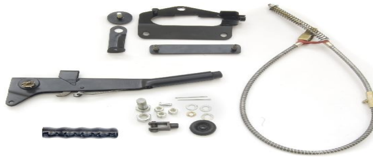
Fig.2 Hand brake set. [4]