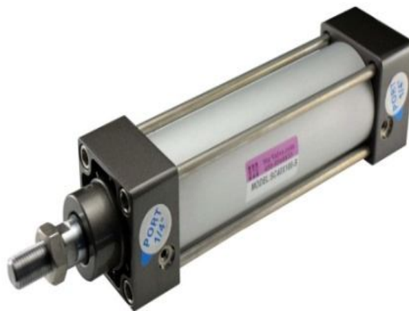
Fig.1 Double acting cylinder. [3]

Cylinders are linear actuators which transform fluid power into mechanical power.