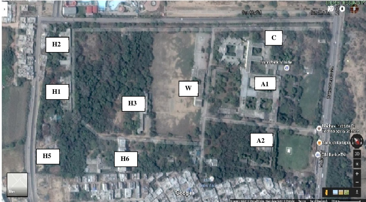
Fig.1 Sampling points in MITS campus.

Waste auditing was conducted to quantify the waste generated. The waste audit constituted of measuring the waste generation rate and finding the composition of the waste. The total quantity of waste generated from the campus is around 150 kg/day or 1.5 quintal/day.