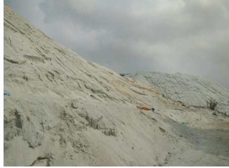
Fig 1: Image of Eco sand from ACC cement factory, madukkarai, comibatore

Vishnumanohar (2014) investigates by carried out Eco sand (finely graded silica) is a locally available, low cost, and inert industrial solid waste whose disposal is a matter of concern likes construction waste. On an overall, the Eco sand can be comparable to the natural river sand. The Eco sand satisfies the zone III gradation for not only to partially replace the sand, but for making good concrete. From the obtained results we observed that the maximum strength is achieved by 15% of fine aggregate replacement with eco sand in concrete. While increasing the percentage of eco sand the compressive strength value is getting decreased. From the SEM analysis, at a 15% replacement the mix remains homogeneous as the micro pores are filled and the transition zone is densified. Higher the percentage of fine aggregate replacement higher was the strength activity index. The strength activity index nearly varies linearly with percentage replacement of fine aggregate with eco sand. The maximum strength activity index was 1.49 at 15% replacement level. From the experimental investigation it was found that 15% replacement level is the optimum level.