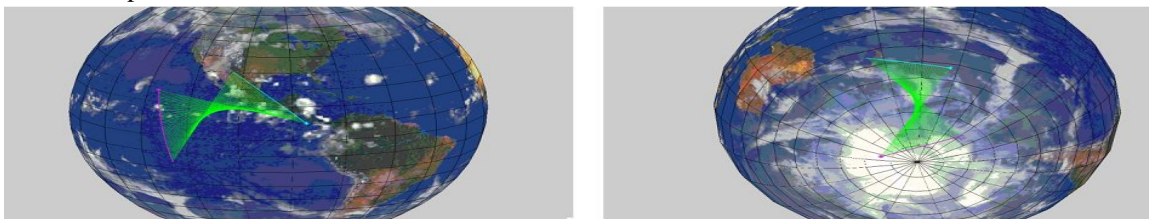
Fig. 2. Localization of the first two optical inter-satellite links.

As space optical inter-satellite link becomes a reality, the structure and design of Optical Satellite Communication network are now feasible. This optical wireless communication (OWC) is considered as next generation technology of FSO satellite networks due to the ability to connect with data rates up to numerous Gbps. Fig. 2 shows the localization of the optical inter-satellite links which were between FIRE and TerraSAR-X. This links were in February 2008 and considered as the first two optical inter-satellite links between two satellites. The first link was put above Central America and the Pacific Ocean with link distance between 3,700 - and 4,700 km. The second optical link was near to the South Pole with The link distance between 3,700 km and 4,875 km.