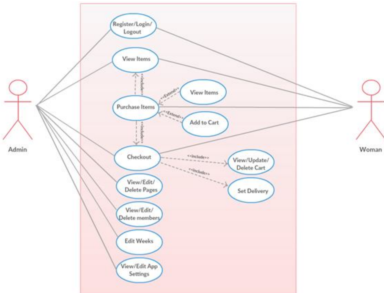
Fig. 1 The BabyApp use case diagram.

The Figure below displays the use case diagram for the proposed application.