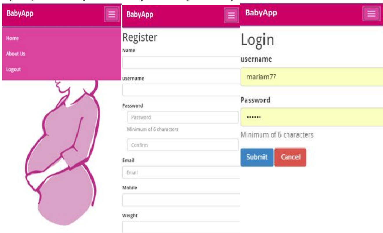
Fig. 2 BabyApp Home Page and Login.

New member should register for new account. The customer should fill the given forms. All forms have validations. For example the Name should not be empty, username must be unique, and Email should contain @ and dot. The mobile number should be filled with numbers only. After the user successfully registered, all of the given information is added into the database. If a member already has an account, she can directly go to login page. This page contains two forms, username and password. The contents of the menu which are mentioned above will appear in the menu. Week information page welcomes the member and informs the member about the week that they are in. The page is an informative page about how big is the baby on that week, and how's the baby in the current week it also contains a video that demonstrates the growth of the baby in the current week.