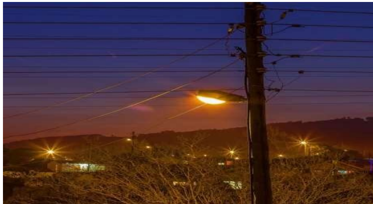
Fig 1 An Image Of Conventional Street Lighting System And Its Wasting Of Power And Resource

High-mast lighting towers are vertical, cantilevered structures that are used to illuminate a relatively large area. Although primarily used for highway intersection lighting in rural areas, they are also utilized in other large areas such as parking lots, sporting venues, or even penitentiaries. As a result, failures of these structures are critical due to the potential for them to fall across highway lanes or other. When tall masts were installed in several cities to illuminate large areas. The first known application of high-mast lighting to highways was the Heerdtter Triangle installation in Dusseldorf, Germany, in the late 1950's. It was followed by installations in other European countries including Holland, France, Italy, and Great Britain. With the passing of the Federal-Aid Highway Act of 1956, interest in High Mast lighting in this country was stimulated by the successful applications in Europe. RomanPage LayoutAn easy way to comply with IJRASET paper formatting requirements is to use this document as a template and simply type your text into it.