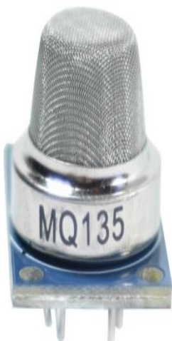
Figure-2(b) MQ135 Air Quality Sensor