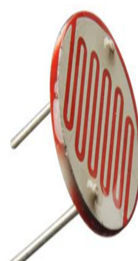
Figure-2(d) LDR Sensor