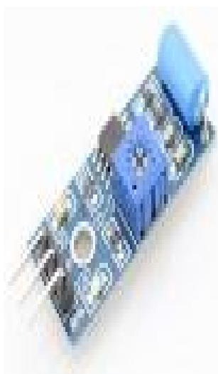
Figure-2(c) SW420 Vibration Sensor