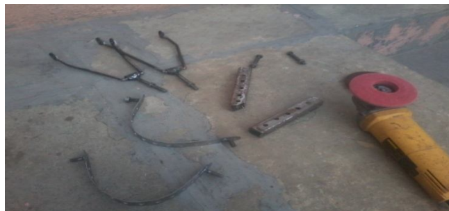
3.2 Shoe Link

Shoe Link is used for attachment of our shoes with chairless chair. It facilitated for easily walking along with chairless chair. It is fixed with the help of nut bolt with lower link.