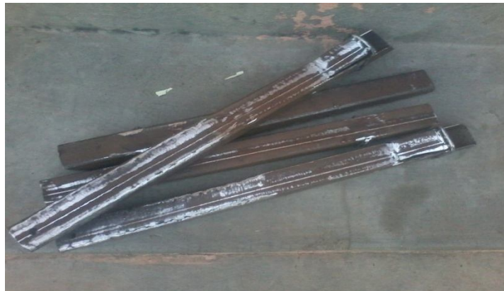
Fig. Mild Steel Link

figure 3.7 . Sectional Area is related to strength in bending so square hollow section is selected, as strength in bending will be more which our requirement is.