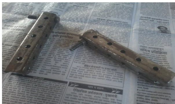
Fig 3.3 Stopper

It is the most important part of our project. This Part gives stability to whole project. It is made up of mild steel.