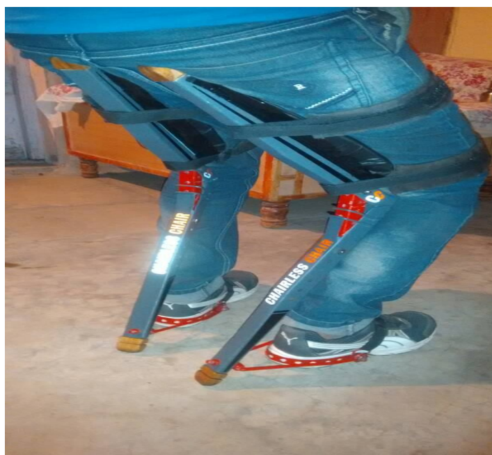
Fig - Experimental Set up of Chairless Chair