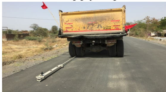
Fig. 2 Position of test apparatus and vehicle axle on road

The truck is driven gradually parallel to the edge and halted with the end goal that the left side back double wheel is midway put over the principal point for diversion estimation. Test end of the Benkelman bar is embedded between the holes of the double haggle put precisely over the redirection perception point. At the point when the dial gage perusing is perusing is stationary or when the rate of progress of asphalt diversion is under 0.025mm for every min, the underlying dial gage perusing DO is noted. Both readings of the vast and little needles of the dial gage might be noticed, the substantial needle may likewise be set zero if essential at this stage. The truck is pushed ahead gradually through a separation of 2.7m from the point and halted. The middle of the road dial gage perusing Di is noted when the rate of recuperation of the asphalt is under 0.025mm every moment. The truck is then determined forward through a further separation of 0.9 m and the last dial gage perusing D f is recorded as some time recently.