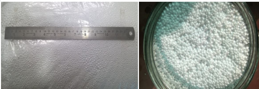
Figure 1: EPS Beads size from 1mm to 5 mm