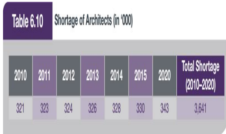
Figure-2: Shortage of Architects. Source: Real Estate and Construction Professionals in India by 2020, Report-November 2011

Nowadays, architectural education and practice are experiencing a shift of Interdisciplinary characterized by the coordinating, articulating, and dominant role of digital technologies. In this new situation the collaboration between architects, architecture education and architecture educators appears to be increasingly necessary a condition. Any creative action takes place in a digital environment which affects all aspects of architectural form from the more abstract and conceptual to its pure materiality. New architectural ideas and concepts related to the generation of forms that correspond to new conceptions of human and social life, of space and time, of nature and context, of speed and change, of communication and globalization, of complexity and order, of stability and movement support and sustain this new condition. (SOURCE: AUTHOR)