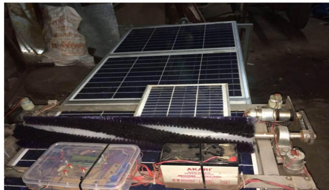
Figure No.3 Proposed Model

The frame with this assembly is mounted on four rollers; all four rollers are having individual motors of high torque and low rpm. Below frame four idle rollers are also given for travelling smoothly on solar panel frame. We have used timer circuit in our machine by which we can set how many times a day our machine will clean the solar panels. Our circuit is having only three press buttons one will start the machine and other two will increase and decrease the time in seconds, which will be shown in display. On both the ends of the machine limit switch is mounted which will stop the machine as it will go on the one end of the solar panel row.