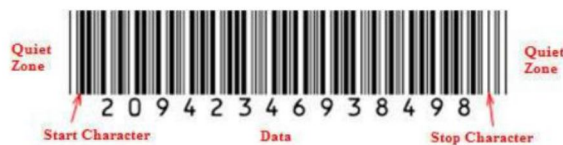
Fig1: Barcode structure

A barcode is an optical machine-readable representation of data relating to the object to which it is attached. Originally barcodes systematically represented data by varying the width and spacing of parallel lines, and may be referred to as linear or one dimensional. Later they evolved into rectangles, dots, hexagons and other geometric patterns in two dimensions (2D). Although 2D systems use a variety of symbols, they are generally referred to as barcodes as well. Barcodes originally were scanned by special optical scanners called barcode readers. The different regions of barcode are as follows: