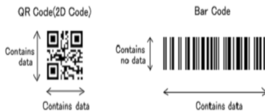
Fig 3: QR code and Barcode