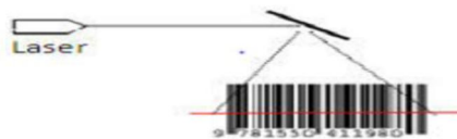
Fig2: Working of Barcode