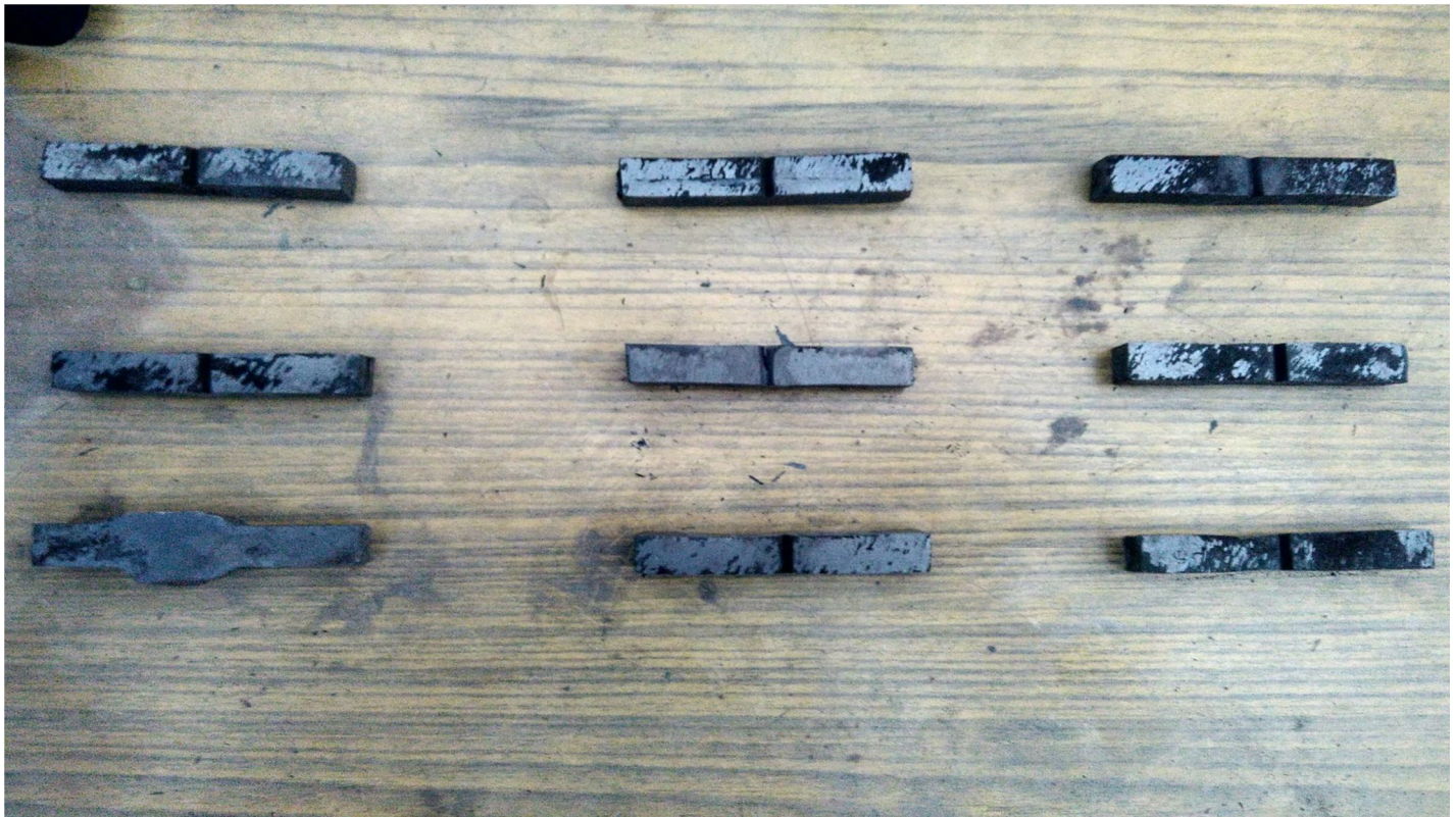
Figure 1: Post weld heat treated charpy impact specimen

The charpy impact toughness test was carried out to examine the ability of different microstructure to absorb energy during the process of fracture. The standard charpy test specimens of size 55×10×10 mm were cut from the joint with the notch of 2 mm located in the HAZ region. 98% alcohol + 2% nitric acid were used etching of weld zone.