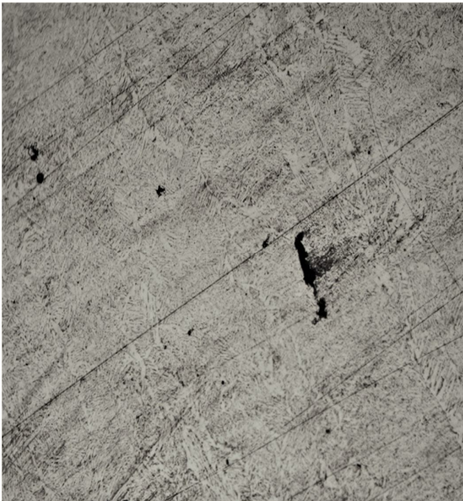
Figure 3: As welded specimen