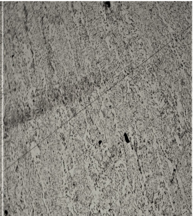
Figure 4: PWHT specimen