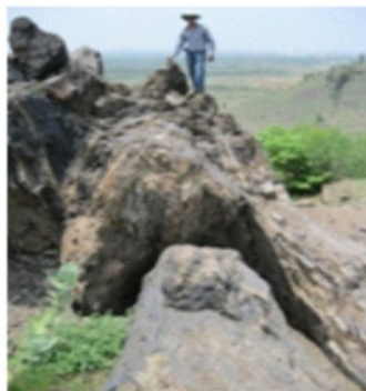
Fig.5 Old workings at Pur-Banera