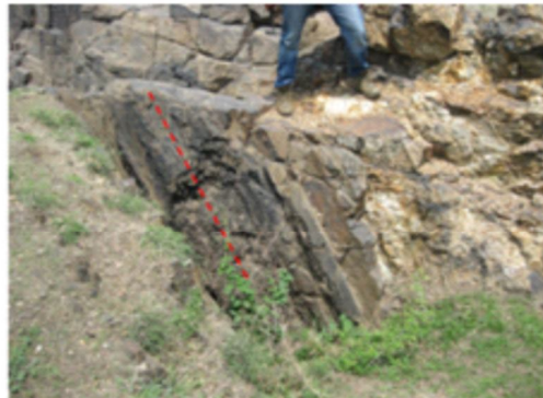
Fig.7 Old workings at Pur-Banera