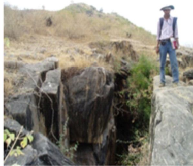
Fig.2 Old workings atZawar area