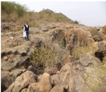
Fig.1 Old workings atZawar area

To date the oldest evidence of pure zinc comes from Zawar as early as 9 th century AD, when distillation process was employed to make pure zinc. The credit of innovating special retorts and furnaces for distillation of zinc surely goes to the Bhil tribe of Southern Rajasthan. It was surely this local knowledge which they could successfully employ for distillation of zinc techniques in the world (Fig. 10, 11 and 12).