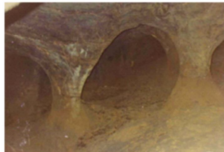
Fig.9 Underground Pratap Khan, Zawar