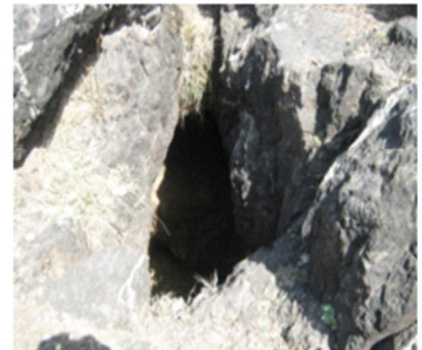
Fig.3 Old workings atZawar area