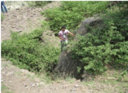
Fig.8 Old workings at Pur-Banera