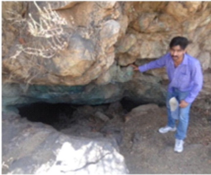
Fig.6(b) Old workings at Phalet Copper Mines