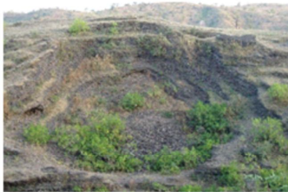
Fig.10 Heaps of slags & retorts at Zawar area