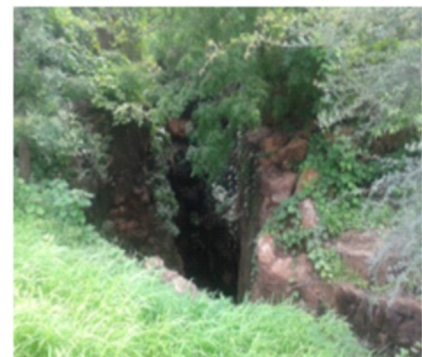
Fig.6(a) Old workings at Bhukia Gold Mines