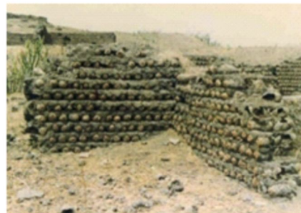
Fig.11 Walls made by used retorts, Zawar