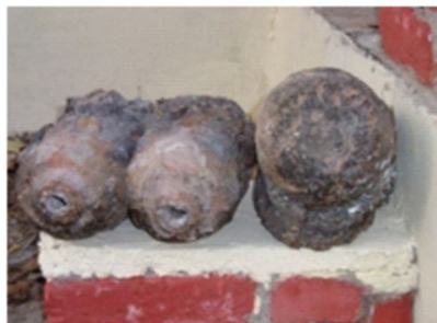
Fig.12 Retorts used in smelting, Zawar