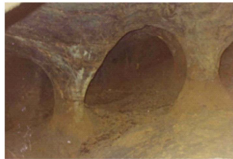
Fig.9 Underground Pratap Khan, Zawar