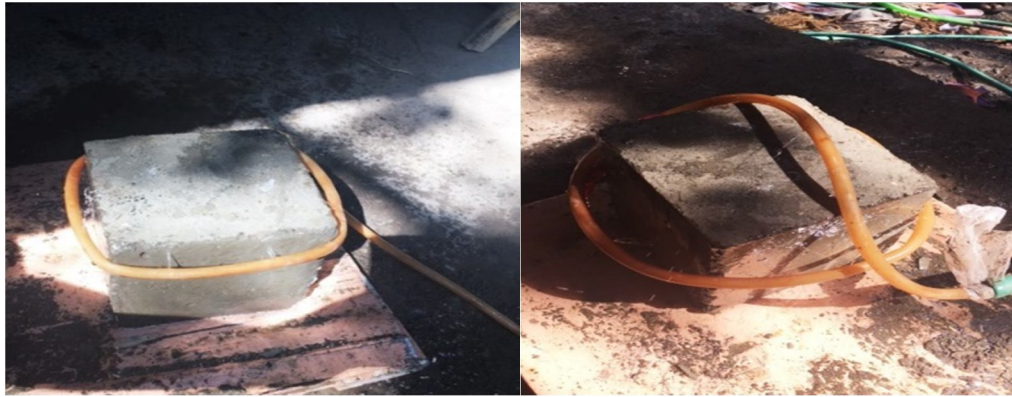
Figure no 3:- Curing of concrete block using drip curing