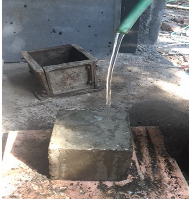
Figure no 2:- Spraying on a concrete cube.

spraying can be done in early morning when there is no other activity at site. But once the other activities like formwork of next proposed structure, brickwork, plaster gets started, there is a movement of labors at site and so practically very less spraying is done in these working hours as it becomes hurdle for the labors doing other activities and so it is avoided. Almost all spraying is done manually and there is a great scope of human error. There are very few controlling methods of keeping the track record of curing by spraying at site. So the curing of concrete and the strength of concrete is almost at mercy of the non-skilled labor, availability of electricity, availability of abundant water and many other things.