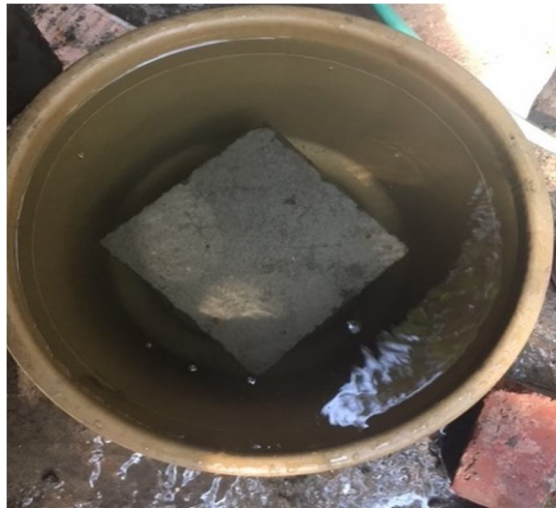
Figure no 1:- cube submerged in a bucket full of water.

Submerging concrete in water is the ideal way of curing. In this concrete cubes are submerged into the water tank till the curing period gets over and every time the buckets are topped up with water to compensate the loss of water due to exothermic reaction of concrete. First 4 blocks are removed from water after seven days and remaining 4 blocks after 28 days. In this the concrete gets in contact with the water for almost all the time and thus the water requirement for the concrete is satisfied 100%. So the strength obtained is maximum. But this method is practically impossible to apply practically on/at project site since the concrete members are in huge quantity and at various heights. To submerge them in water is totally impractical and impossible. And hence desired strength as per the IS standard is not obtained by the concrete members practically.