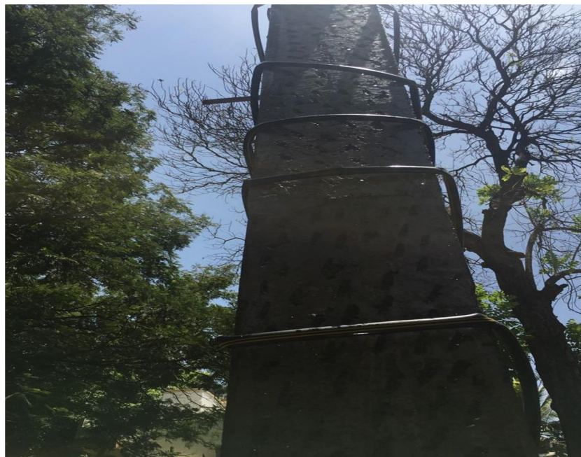
Figure no 6:- drip curing applied to a column on site