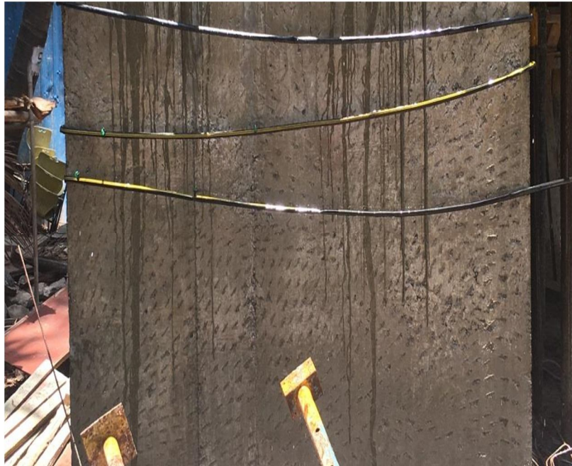
Figure no 7:- Drip curing applied on a lift shaft on site