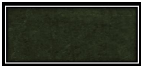
Fig.4 Toyserkan Black Granite