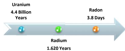
Fig. 2 The half-life of radon and uranium [9]

material eroded from the earth's crust contain uranium. About 99.3% of this uranium is of type ^{238}\text{U} that leads to stable isotopes ^{206}\text{Pb} due to 14 efforts. Geologically, the uranium-bearing minerals, especially monazite in granitic rocks are of the main origins of radon in rocks, soils and groundwater.