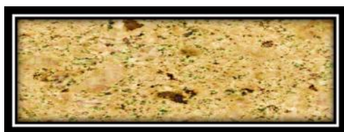
Fig.7 Khoramdareh Golden Granite