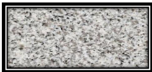
Fig. 5 Zahedan White Granite