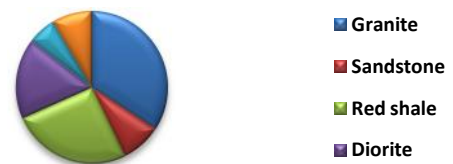
Fig.3 The average amount of uranium (measured in grams per ton) in different stones (Granite has the highest rate)