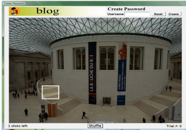
Fig 2: Persuasive Cued Click point

view port guides users to select more random passwords that are less likely to include hotspots. PCCP is very much time consuming process since the user who already destined for particular click-point may have the option to shuffle again till that viewport get relocated. The images will be shown normally with no concept of either shading or viewport thereby the users can select any point over the existing images during password entry.