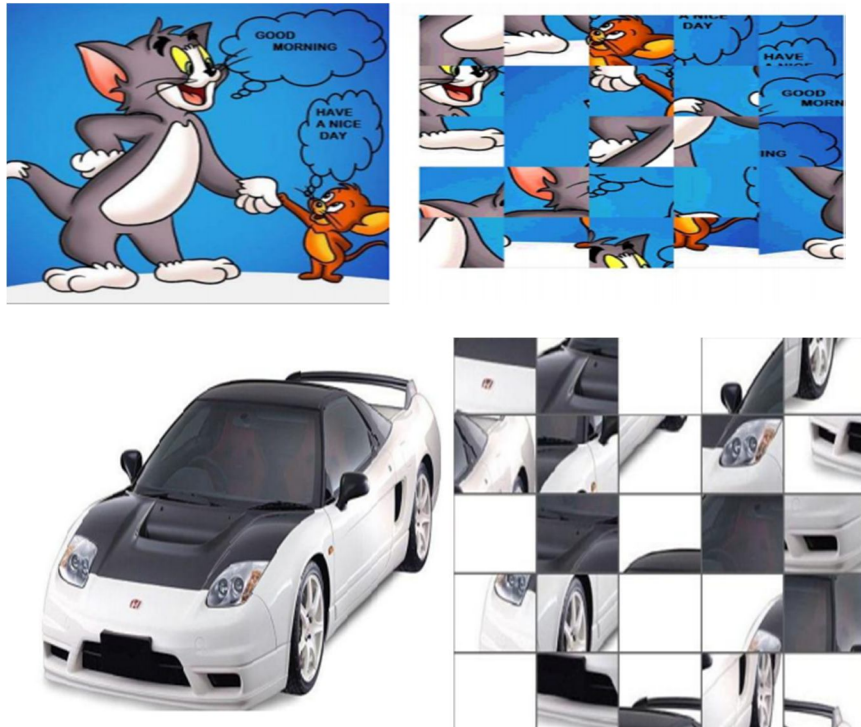
Fig 4: Two scrambled images from a set

Above 4 images will act as password, Pw for user (U i ) Pair (Pw, U i ) will be stored for each user.