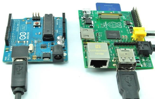
Figure 2.2.1 - RaspberryPi - Arduino Communication

The reason it works is because the Arduino does not have any pull-ups resistors installed, but the P1 header on the Raspberry Pi has 1k8 ohms resistors to the 3.3 volts power rail. Data is transmitted by pulling the lines to 0v, for a "high" logic signal. For "low" logic signal, it's pulled up to the supply rail voltage level. Because there is no pull-up resistors in the Arduino and because 3.3 volts is within the "low" logic level range for the Arduino everything works as it should.