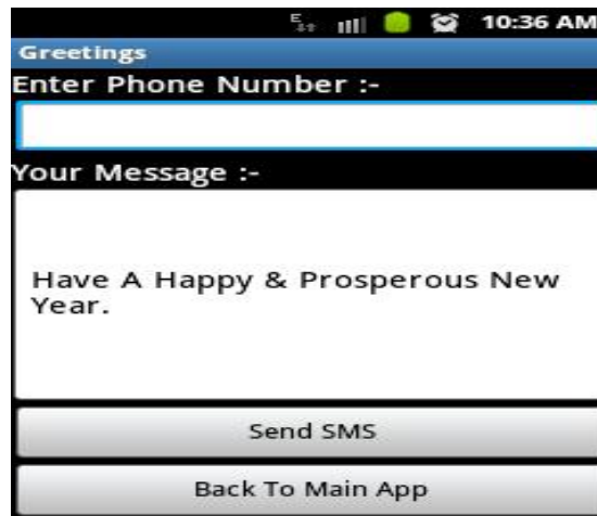
Figure 2. New Year Intent Page of Application