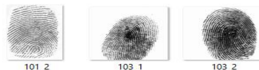
Fig.2. Fingerprint images obtained during Acquisition stage

This section describes the working of the proposed model of fingerprint authentication system using minutiae matching.