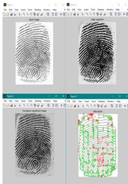
Fig.3. (a) Input image (b) Ridge segment (c) Histogram equalization (d) Bifurcations