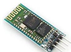
Fig 3: Bluetooth Module