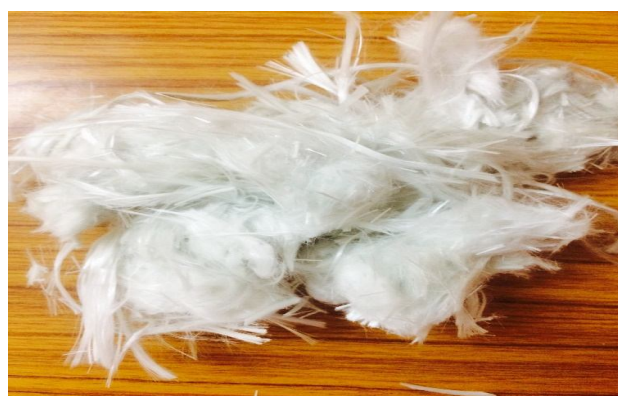
Fig (2) raw glass fibres.