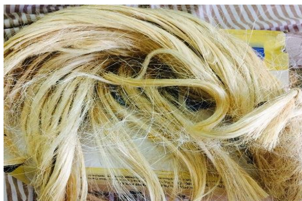
Fig (1) raw sisal fibre

Table 2 above defines the mix properties of sisal and glass fibre that should be kept in mind while we are using those fibres in conventional concrete. Sisal and glass fibre don't get deteriorate with time when we use a low content of Portland cement and calcium hydroxide to reduce the potential aging of sisal fibre and it is important to know its deterioration pattern for the durability of these fibres in a normal concrete when used for a long time. Sisal fibre could be mixed in many proportions and at various lengths by different methods like hand mixing, pan mixing, spraying fibres and cement slurry and hand laying fibres etc. Glass fibre should not be mixed more than 1 minute otherwise it will break into pieces and it will not be suitable to work with[3]. Sisal fibre doesn't absorb moisture or attract any dust[1] but on the other hand, glass fibre easily absorbs moisture and can worsen microscopic cracks and surface defects and thus reduce tenacity. Sisal fibre when used in various lengths ranging from (10-40)mm and proportions like (0.3-1.5)% give better results but in the case of glass fibre, it was seen that crimped state of fibre give better results than straight and hooked fibres[5].