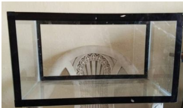
Fig.4: Experimental Glass container

A steel circular plate precipitation appropriation framework was utilized to mimic uniform precipitation from a consistent stature at a consistent rate. This plate resembles a grinding of 2mm opening with 25.4mm focus to focus dividing. It is made to rest on two thick wooden sheet boards at a constant height on either side of the Glass container for rainfall as shown in the fig.