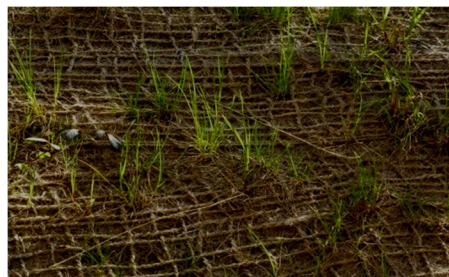
Fig. 13: Vegetation Canopy on the Jute Geotextile

For the break time frame, Geojute, an open work sort of normally biodegradable jute Geotextile, is utilized as a part of request to hinder the best soil disintegration. When the Jute Geotextile overlay decomposes and becomes nutrient for accelerated vegetative growth, vegetation canopy gets established as shown in the figure below. Eventually, it becomes a sustainable as well as eco-friendly solution for reducing erosion of top soil of the exposed surface of the slope.