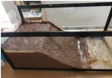
Fig 7: Compacted soil in the mode

At that point precipitation of rough power of 120mm/hour was appropriated consistently finished the dirt surface from a consistent tallness to keep up steady precipitation vitality for all tests for the duration of the time. The volume and force of precipitation was checked at each ten moment interim. All the while, the dirt washed away with overflow water was isolated with channel and weighed after air drying. Both overflow water volume and dissolved soil mass were measured at ten moment interim. This procedure was rehashed a few times for uncovered soil to acquire a delegate result.