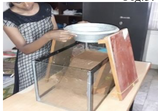
Fig.6: Rainfall Distribution system