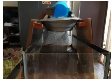
Fig 8: Rainfall Distribution on Bare soil