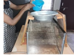
Fig 11: Supply of water for Rainfall distribution