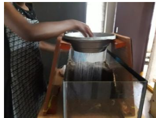
Fig 12: Uniform distribution of Rainfall on the Geojute

Now again precipitation of inexact power of 120mm/hour was circulated consistently finished the dirt surface from a consistent tallness to look after steady precipitation vitality for constantly. The volume and force of precipitation was checked at each ten minute interim. All the while, the dirt washed away with overflow water was isolated with channel and weighed after air drying. Both overflow water volume and dissolved soil mass were measured at ten moment interim. This procedure was rehased a few times to obtain a representative result.