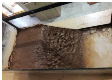
Fig 9: Soil Erosion after the rainfall Distribution on Bare soil

After the culmination of these trials on exposed soil this procedure was rehashed for incline secured with geojute under comparative conditions utilizing same degree of soil. As some time recently, for this situation likewise every one of the readings were taken at ten minutes interim and the diagrams were plotted to look at acquired esteems.