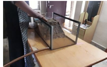
Fig.5: Container with drain pipe for collecting runoff water