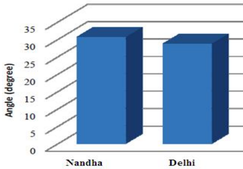
Figure 1 Yearly averages slope angles