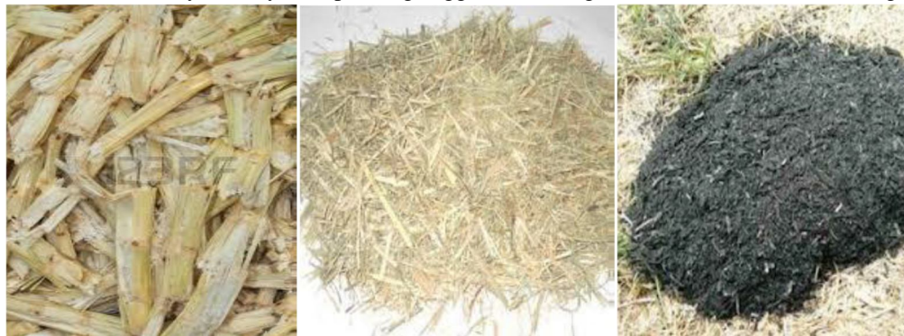
Sugarcane Bagasse and Sugarcane Bagasse Ash

Fiber reinforced concrete (FRC) has been widely used for industrial pavements and small (non-structural) precast elements or sprayed in tunnels. Besides the non-structural elements (pipes, culverts and other small components), fiber reinforcement is particularly appealing for large structural elements. Here steel fibers may be successfully adopted in substitution, at least partly, of the conventional reinforcement (bars or welded mesh) to reduce labour costs (since the conventional reinforcement is placed manually [20]).