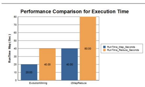
Figure 3- Performance Comparison of the Execution Time against the Incremental processing Techniques

Further improves the performance with incremental processing of EvolutionMining, reducing the run time as described in the figure 3.