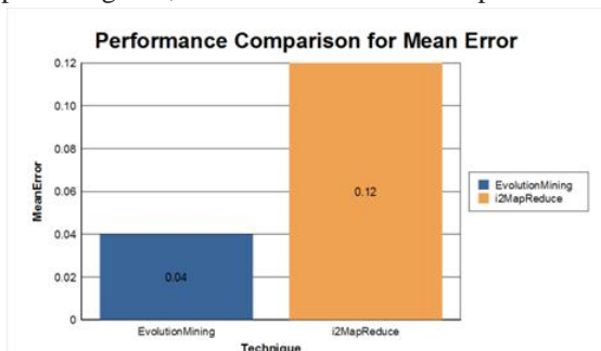
Figure 2: Performance Comparison of Mean error for incremental processing

The Evolutionmining technique speed up convergence, and reduce the time and space overhead for saving states.