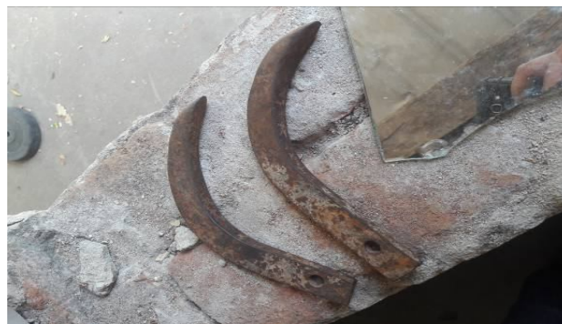
Fig.2 Furrow Opener.

On older planters, the disks may need sharpening or adjusting to properly cut the residue. As the disks wear, a gap develops and allows residue and soil to wedge between the disks. If this occurs, remove spacer washers behind the disks and adjust to maintain about two inches of blade contact on the leading edge of the double-disk seed furrow openers. When properly adjusted and maintained, double-disk seed furrow openers without coulters also can cut dry land corn or grain sorghum residue, especially if the stalks were shredded or heavily grazed.