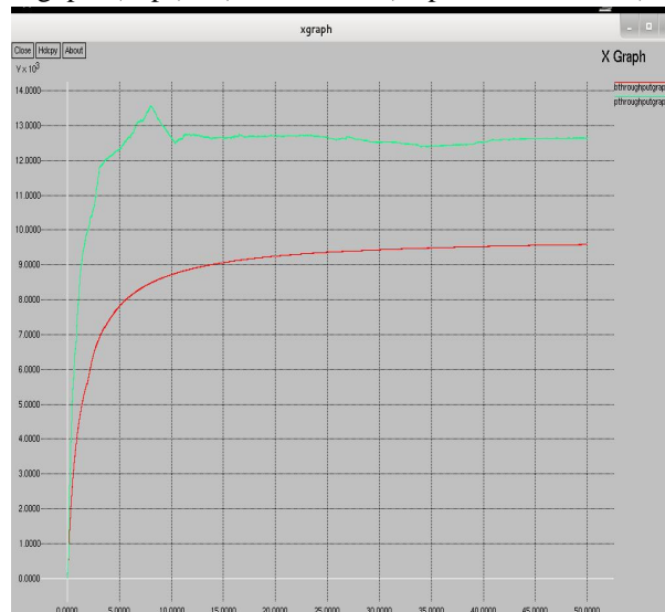
Fig.3 Throughput Graph