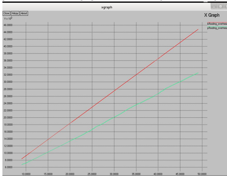
Fig.4 Routing Overhead

It is the whole wide variety of control packets inside the network at some stage in the transmission of data from source to destination. The graph shows that the routing overhead is less in the proposed work which is greater in existing technique.