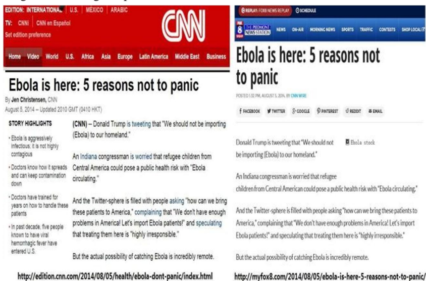
Fig: - An example of copied pages