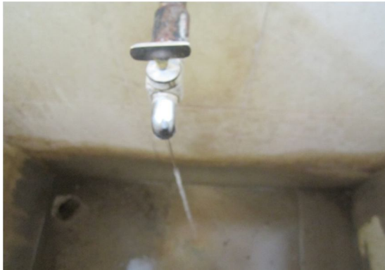
Fig 2: Water Leakage after tap is closed.