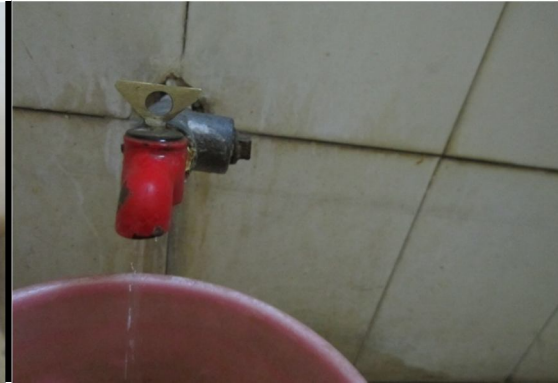
Fig 3: Water Leakage after tap is closed.