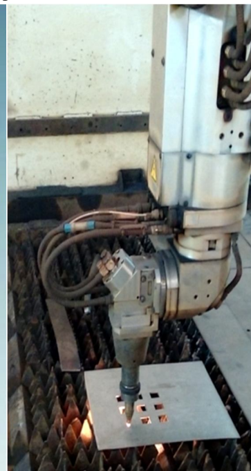
Fig 2: The CO2 laser-machining center (Trumatic L6050)