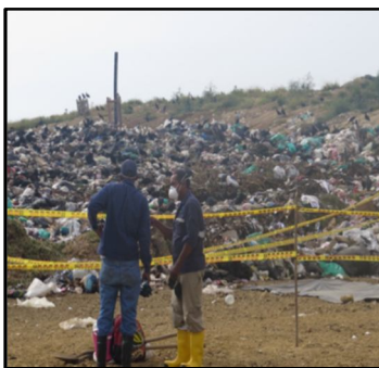
Figure 1: Delimitation of landfill area for collection of samples. 2016

We proceeded to delimit and organize a special area of the landfill for the direct unloading of the collection trucks in order to proceed with the sampling of the RS.