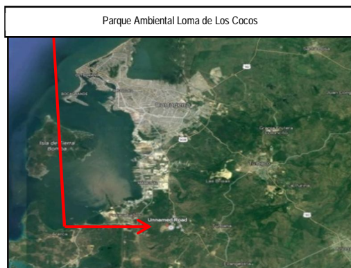
Map 1: Location Loma de Los Cocos landfill – Turbana (Col). 2017

As a source of primary information, the field data obtained in the implementation of the association agreement SECGEN No 0000007 of May 27, 2016, established between the Technological Foundation Antonio de Arévalo -TECNAR and the municipality of Turbaco, whose main purpose was the Update of the Integrated Management Plan for Solid Waste (PGIRS) of the territorial entity. This was done to comply with the provisions of decree 1077 of 2015 and resolution 754 of 2014 of the national government of Colombia.