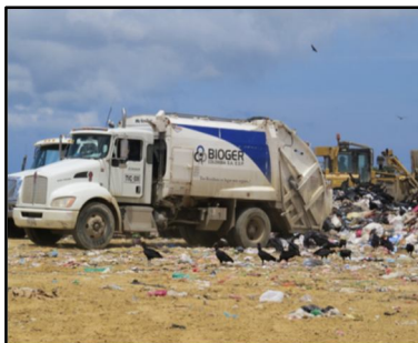
Figure 2: Unload truck collectors. Landfill. 2016.

In the discharge area defined for the sampling process, each truck left a representative part of the dragged content. Three (3) and four (4) samples were worked per day.