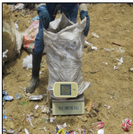
Figure 4: Collection and weighing of final samples. Landfill. 2016

Once the definitive samples of the quartet process had been taken, they were collected and weighed. The data obtained were recorded in the monitoring template.